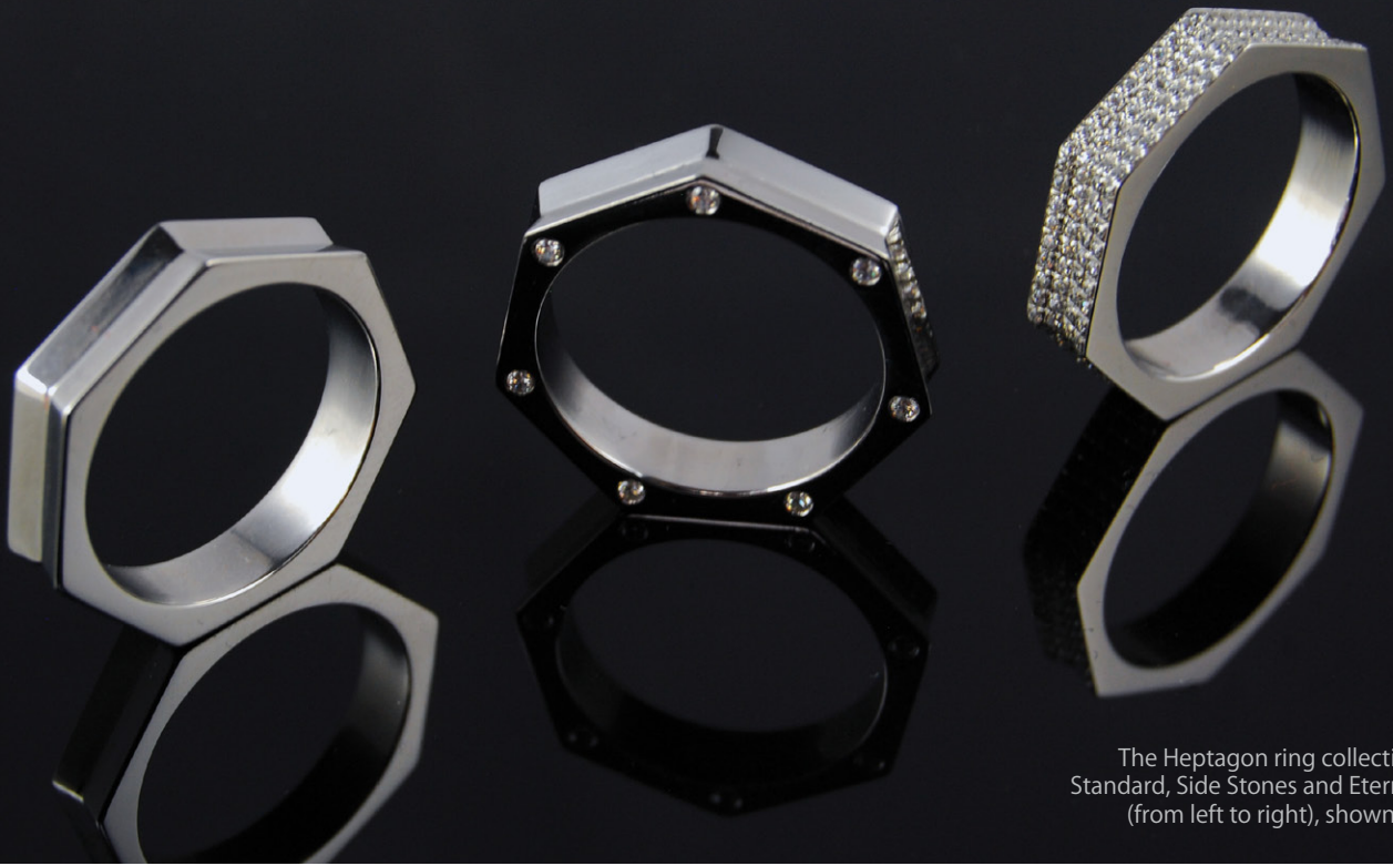
The Heptagon ring collection for Men. Standard, Side Stones and Eternity versions (from left to right), shown in platinum

The Heptagon mens ring is 5mm thick and available in three configurations, Standard, Side Stones and Eternity. Their characteristics are as follows: