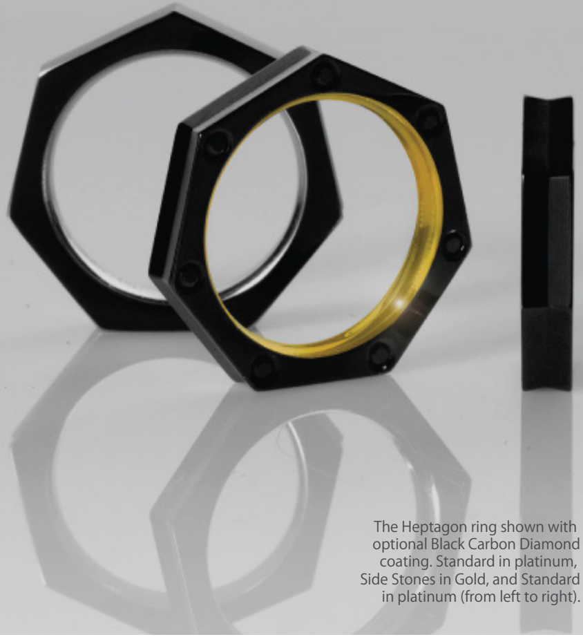
The Heptagon ring shown with optional Black Carbon Diamond coating. Standard in platinum, Side Stones in Gold, and Standard in platinum (from left to right).

Brikk's 'profit for philanthropy' model funnels proceeds to assist populations around the world suffering from hunger and starvation. For each product sold, a specific amount of rice is allocated and distributed to those in need through select NGOs to areas such as Somalia and the Horn of Africa. Brikk's dream is simple: that other luxury brands will follow their example and adopt a permanent 'profit for philanthropy' model. The Heptagon collection features a metric ton of rice (1000kg or 2,200 pounds) distributed to the hungry for each piece purchased.