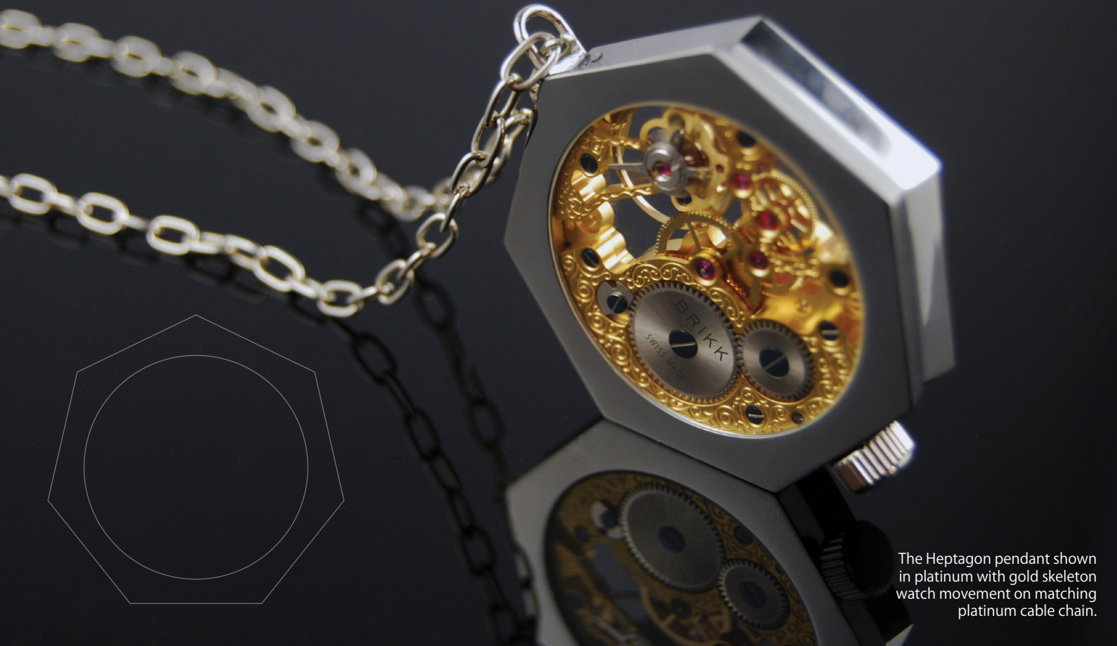
The Heptagon pendant shown in platinum with gold skeleton watch movement on matching platinum cable chain.

The Heptagon is a seven sided shape. A shrine to the number Seven. Seven has great cultural, scientific and religious significance; its history is enormous. Its allure includes the seven colors of the rainbow, seven seas, seven continents, seven scales of music and seven days of the week. The greatest religions in the world all acknowledge the mystical significance of Seven, including Christianity, Judaism, Islam, Hinduism and Buddhism. It is more than a number. Its unique and special qualities can be listed ad infinitum, its importance reflected across world cultures and history.