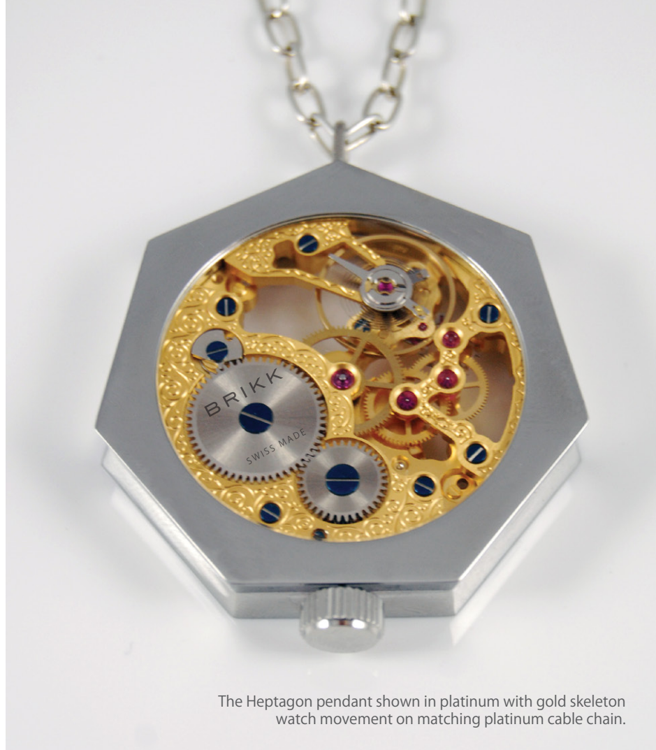
The Heptagon pendant shown in platinum with gold skeleton watch movement on matching platinum cable chain.

The Heptagon pendant is the worlds first horological jewelry. It houses a fully functional Swiss made skeleton mechanical watch movement suspended between two pieces of sapphire glass and features nearly three ounces (81 grams) of precious metal.