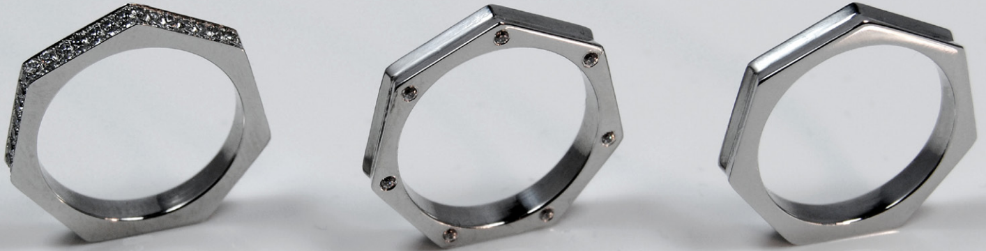
The Heptagon ring collection for Her. Standard, Side Stones and Eternity versions (from left to right), shown in platinum

The Heptagon womens ring is 3mm thick and available in three configurations, Standard, Side Stones and Eternity. Their characteristics are as follows: